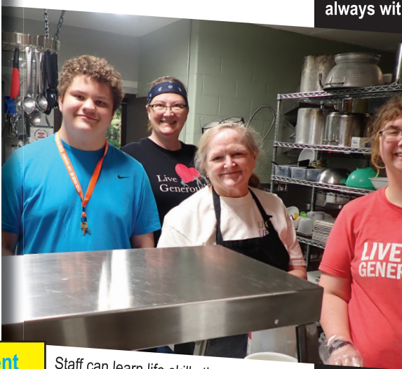
Staff can learn life skills that equip them to positively handle high intensity, fast paced work environments with prayer and purpose.