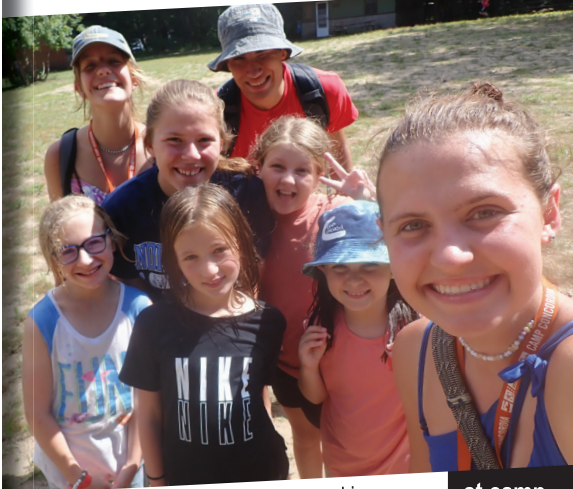
Staff can learn team skills for working with groups of all ages.