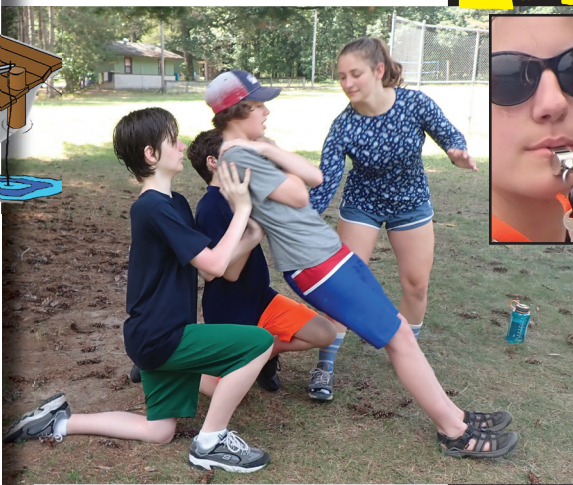
Summer staff have the opportunity to gain the skills necessary for group facilitation.